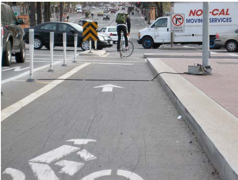
Bike lane, soft-hit posts and concrete barrier island at Octavia and Market Street.