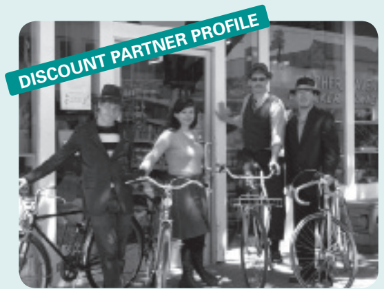
Bike-riding workers at Other Avenues Co-op

Use the pedestrian path to get to your destination or to the crosswalk.