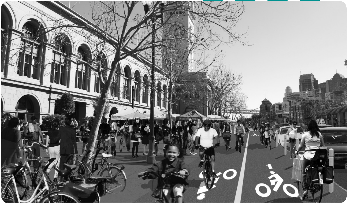
An artist's rendering of a bi-directional bikeway along the Embarcadero.