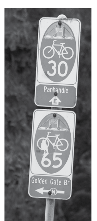
Old wayfinding signs posted across SF relied on people knowing numbered bike routes.

For example, the SFMTA decided not to direct people to the Bayview, generally, but more specifically to the Bayview Public Library, offering both precision and the general direction of the neighborhood. The same goes for signs directing folks to Forest Hill Station, Civic Center and many other landmarks across San Francisco.