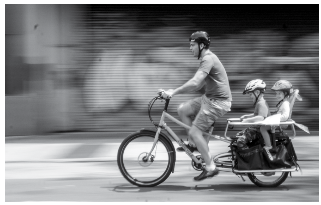
Join families across the world celebrating International Walk & Roll to School Day on Wednesday, Oct. 5.