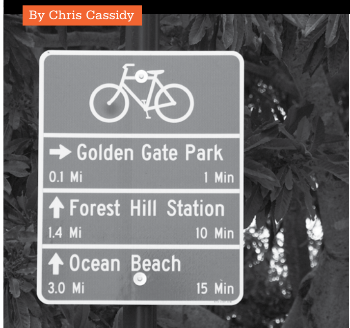
Over 1,000 new wayfinding signs are coming to San Francisco, emphasizing distances, destinations and ride time.