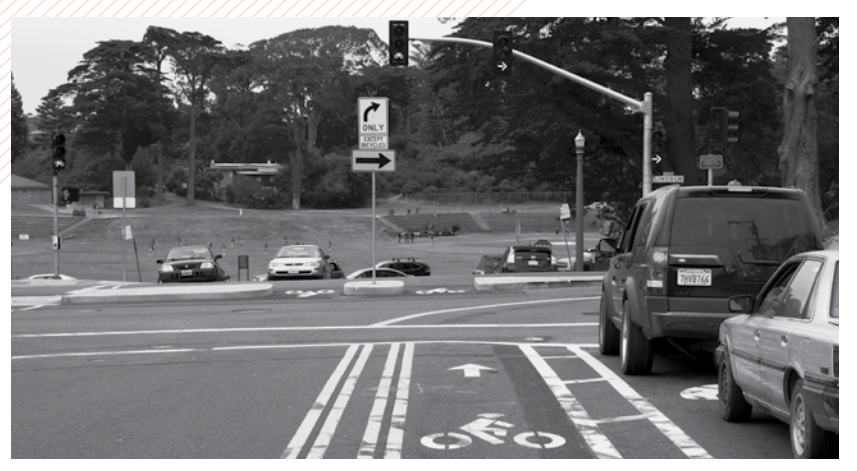
The SFMTA recently installed a new bike-only shortcut into Golden Gate Park at Seventh Avenue and Lincoln Way.