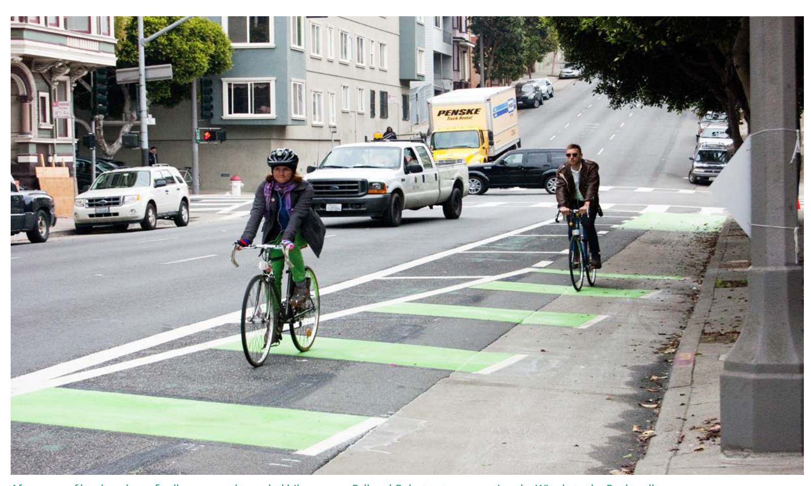
After years of hard work, we finally won much-needed bikeways on Fell and Oak streets, connecting the Wiggle to the Panhandle.

Thanks to our work with community groups and City agencies, the Great Highway was repaved and striped with new bike lanes. This crucial project opens up safer, more enjoyable biking for recreation riders and tourists who use this route heavily, as well for local commuters.