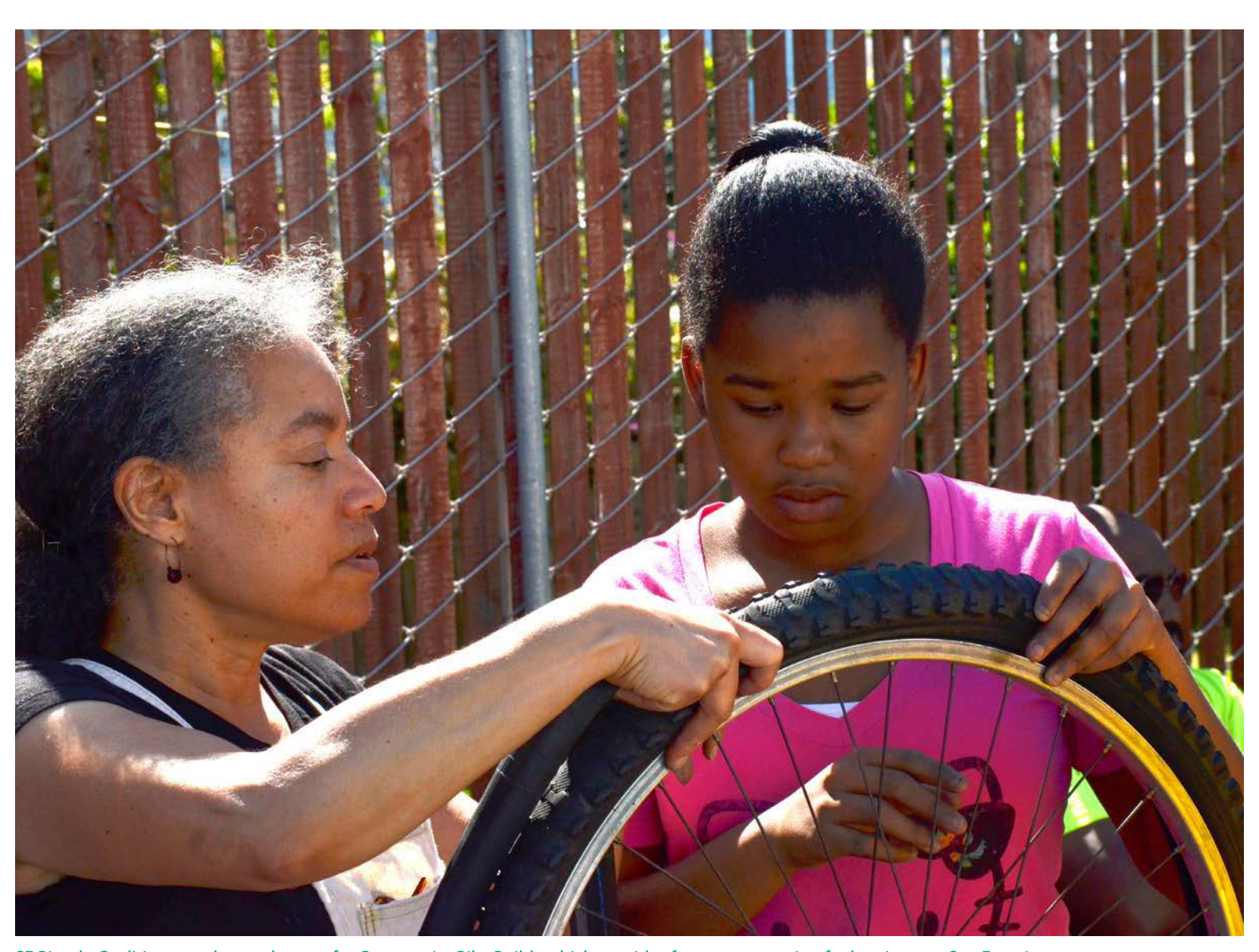
SF Bicycle Coalition members volunteer for Community Bike Builds which provides free transportation for low-income San Franciscans.