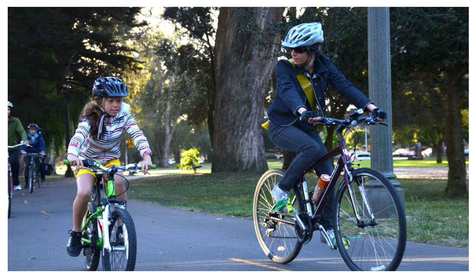
San Francisco hosts the biggest Bike to School event in the nation, and the SF Bicycle Coalition hosts family biking events all year long.