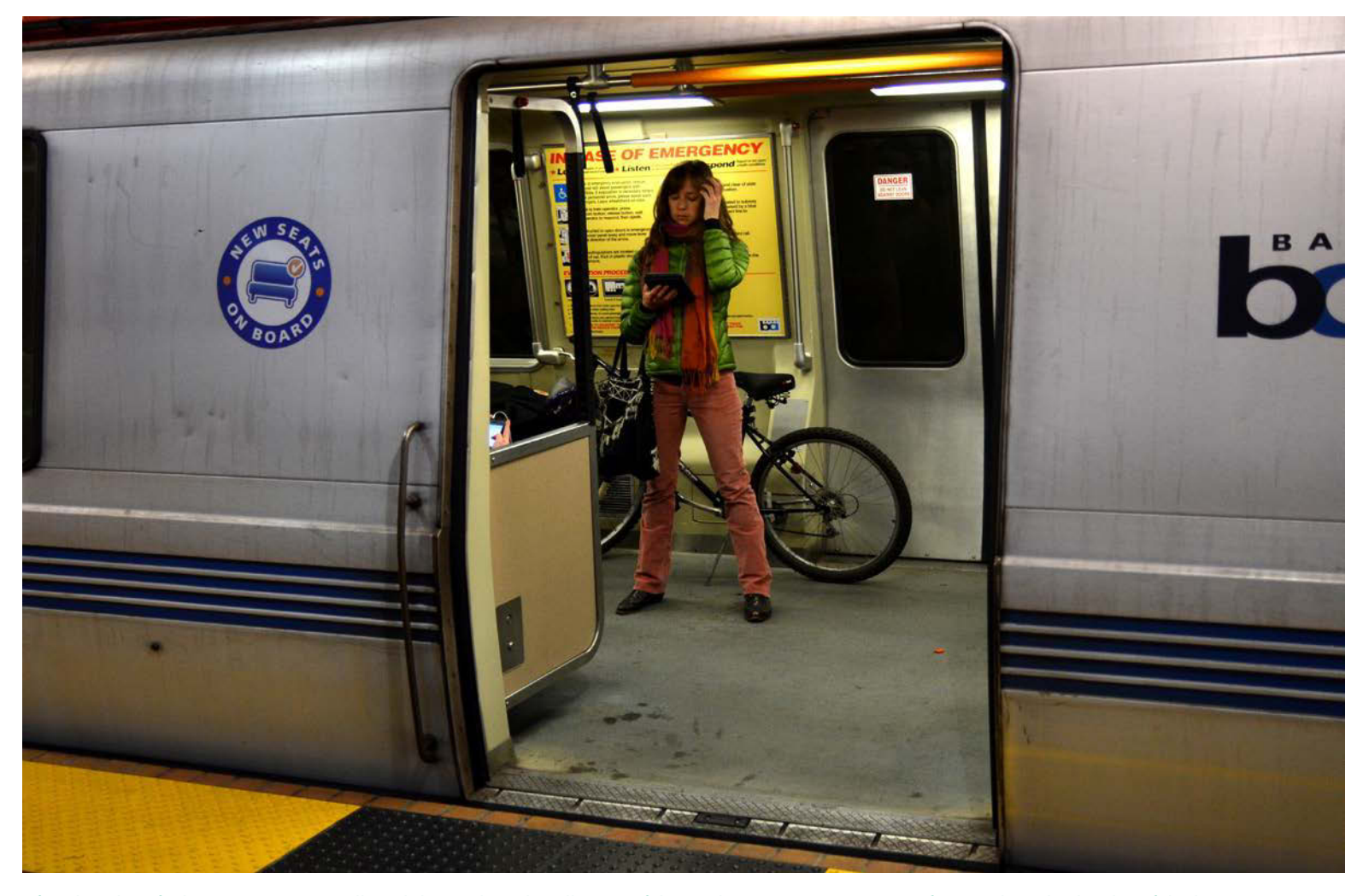
After decades of advocacy, BART now allows bikes on board at all times of day, making an easier commute for people on both sides of the bay.