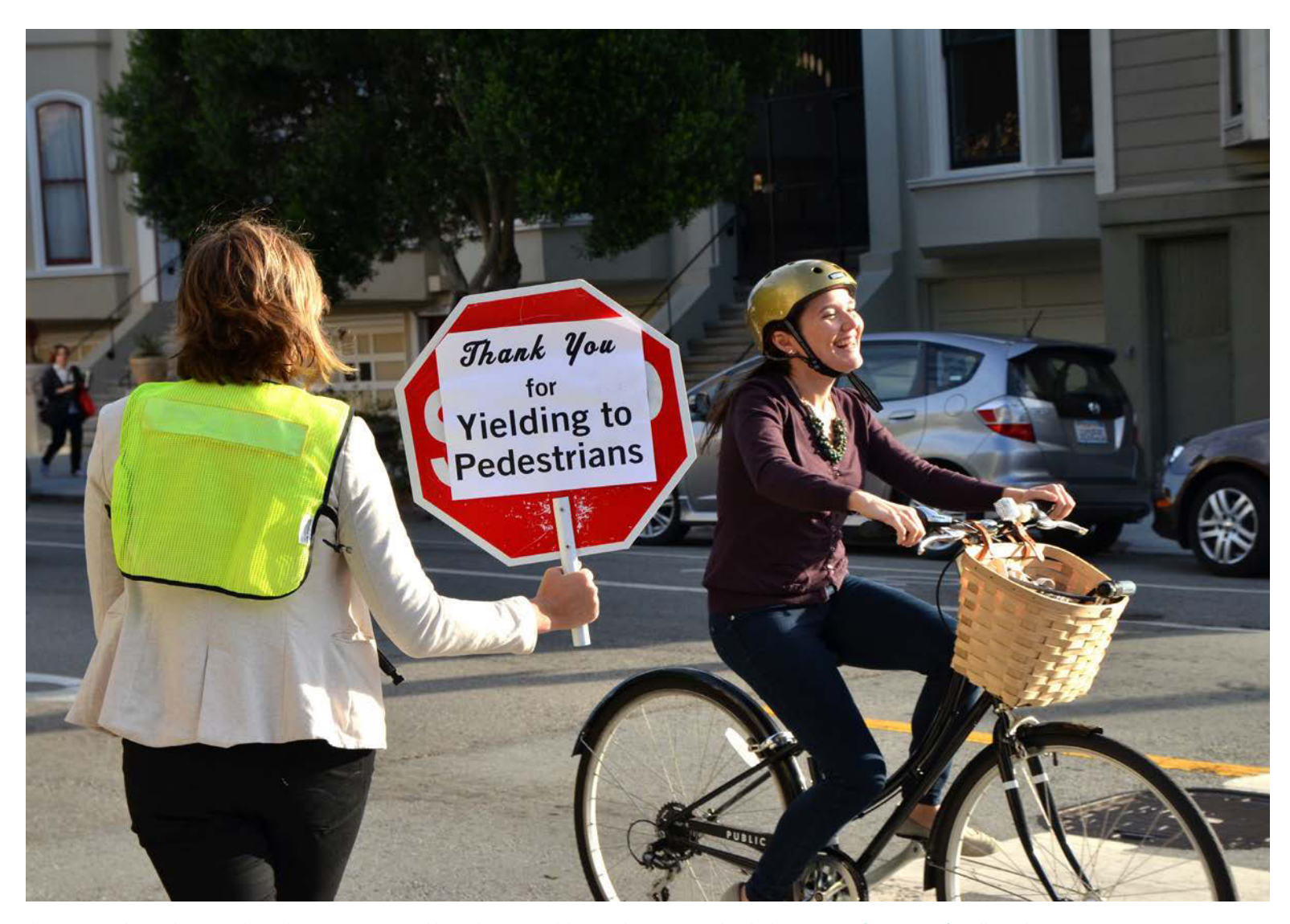
The SF Bicycle Coalition's Bike Polite events remind bicyclists to yield to pedestrians and to help create safer streets for all road users.

In 2013, we launched our Bike Polite campaign to remind people on bikes to yield to pedestrians. We set up stations around the city, acting as crossing guards and offering positive reinforcement for those who bike polite.