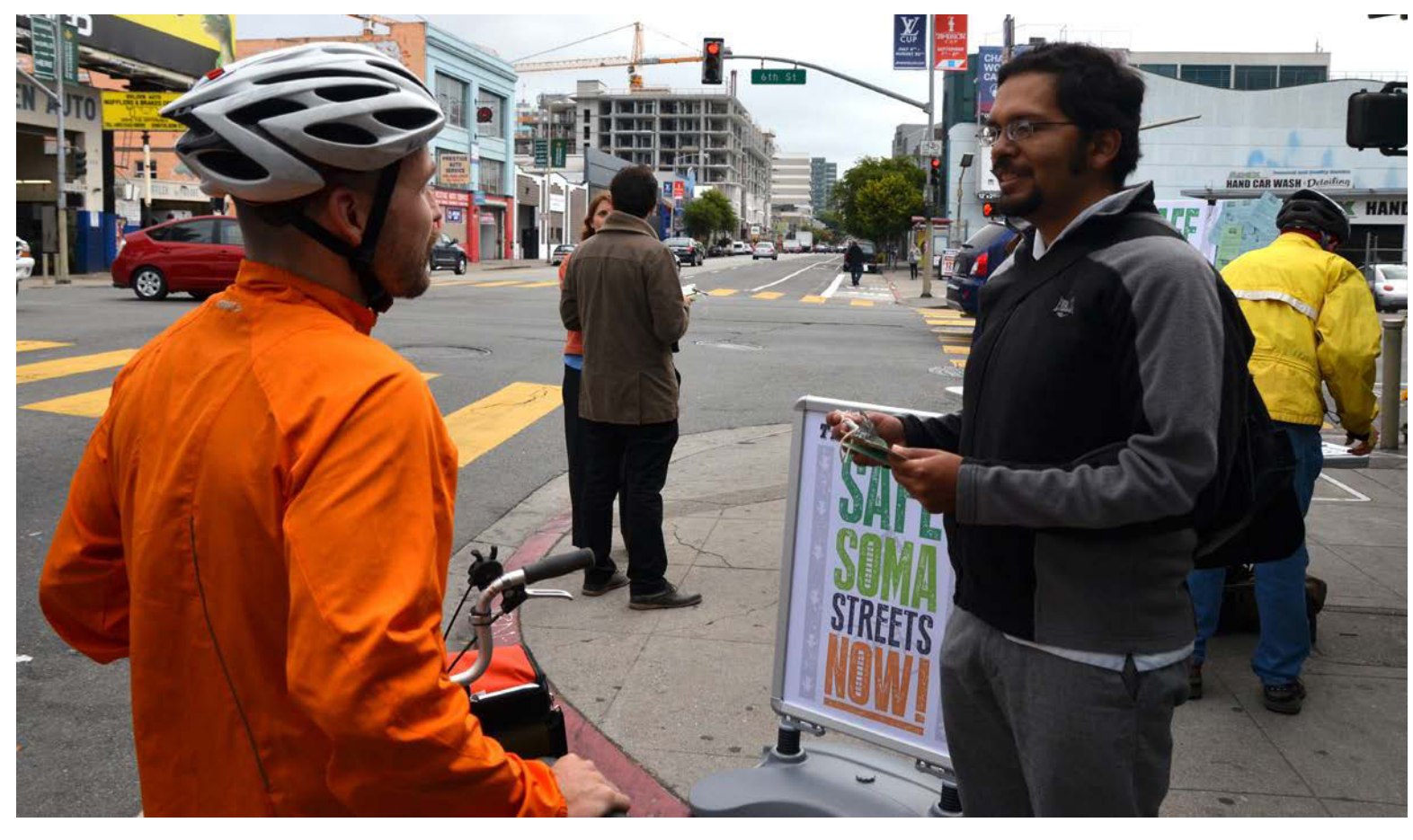
In response to a series of bike rider fatalities in SoMa, we launched our impactful Safe SoMa Streets campaign.