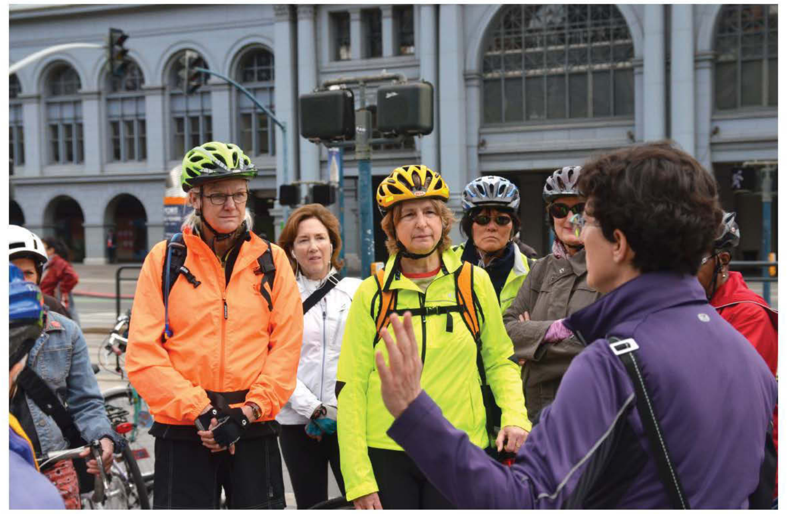
Our member-led Gals With Gears group hosts rides for women 50+ years and older. One of the regular riders is an 83-year-old woman.