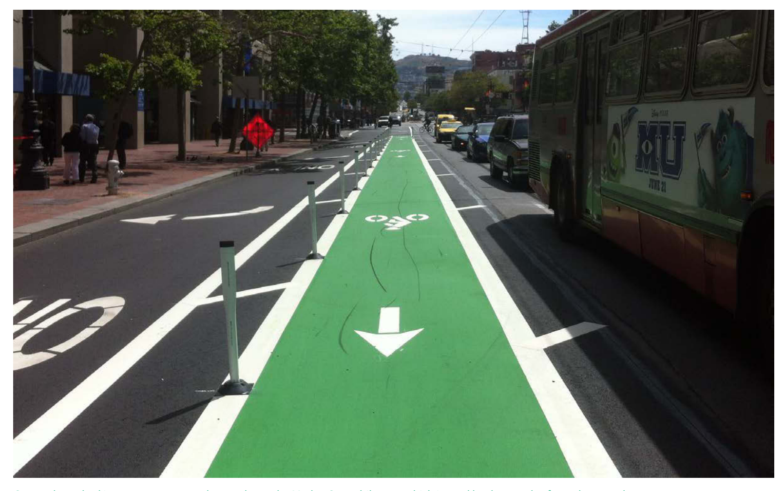
Our work resulted in new pavement and upgrades to the Market Street bikeway, which is used by thousands of people every day.