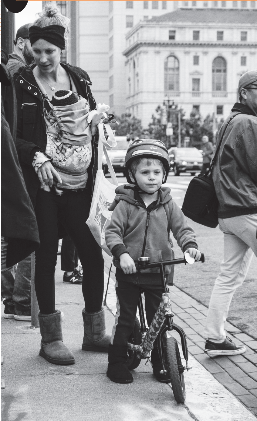
San Francisco's 2017 Bike to Work Day was the biggest celebration of biking in North America yet, with the SFMTA reporting that there are now 82,000 bike trips in SF daily.