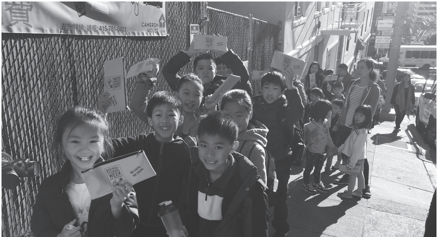
Students at Gordon Lau Elementary celebrating 2017 Bike & Roll to School Week in April