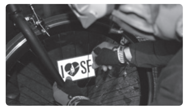
Every year we hand out free bike lights and reflective spoke cards with the SFMTA.

Daylight Saving Time is just around the corner (Sunday, November 2). Your clock might adjust automatically, but what about your beloved bicycle? To help make sure folks don't get caught in the dark, the SF Bicycle Coalition is partnering with the SFMTA again this year for our hugely popular Light Up the Night program. We'll be popping up in surprise locations around town, distributing free lights to people riding without them, and we want your help! Sign up at sfbike.org/volunteer.