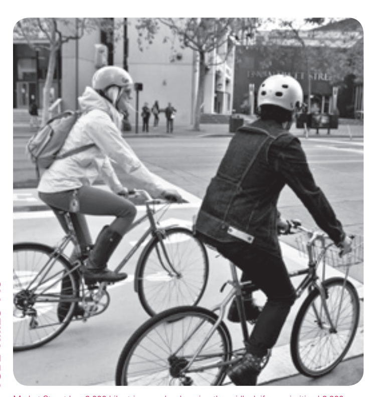
Market Street has 6,000 bike trips per day. Imagine the gridlock if we prioritized 6,000 extra cars instead. Vote No on Prop. L!

Proposition B also provides valuable funding for road safety improvements and Muni by better aligning the funding that goes