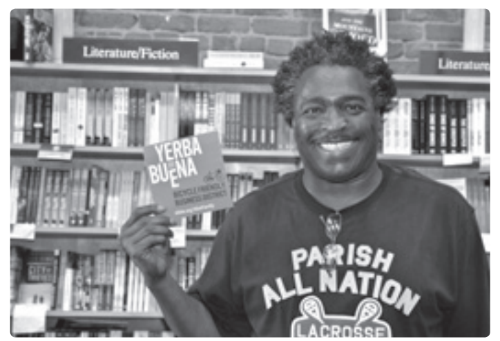
Alexander Book Co. showing support for Yerba Buena Bicycle-Friendly Business District

helped build community in the Yerba Buena neighborhood South of Market and improve safety for all residents, workers and visitors. Pedal on over to Yerba Buena shops and get discounts at local businesses. Thanks to the Yerba Buena Community Benefit District for the support and grant to make this vision of better biking a reality. See participating businesses at sfbike.org/business.