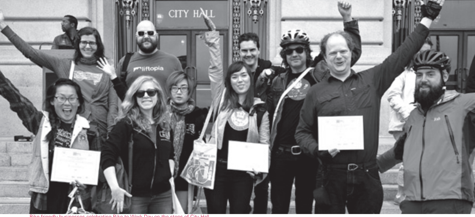
sses celebrating Bike to Work Day on the steps of City Hall